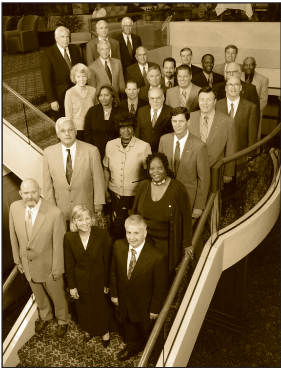
These employees represented Norfolk Southern at the 2004 E.H. Harriman awards ceremony.