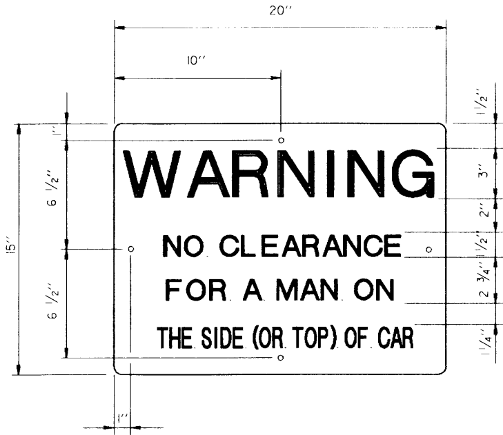
CLEARANCE SIGN (ILLINOIS) (Black Screened Letters On White Background)