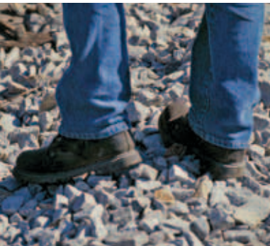
■ A safety reminder for road crews is to always watch your footing.

“We can’t be everywhere at one time,” he said, “and we purposely educate and empower them to be an extension of a trainmaster, more or less. It’s not to get anybody in trouble but just to make sure that everybody stays safe.”